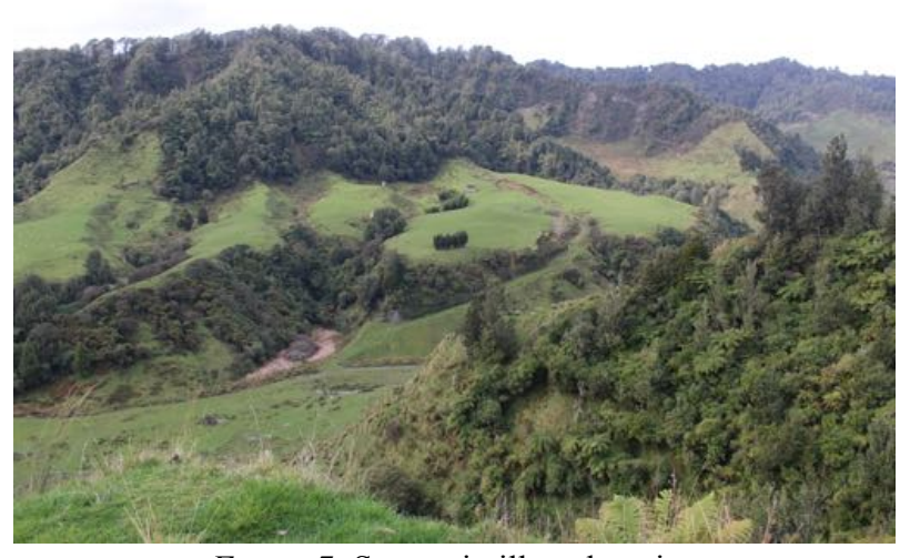
Figure 7: Samurai village location