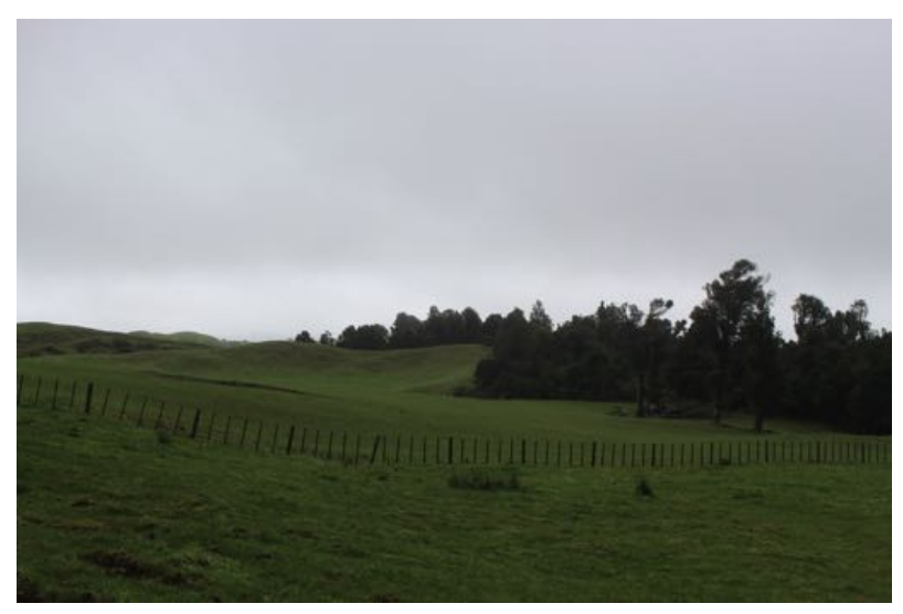
Figure 5: Meiji army command hillocks