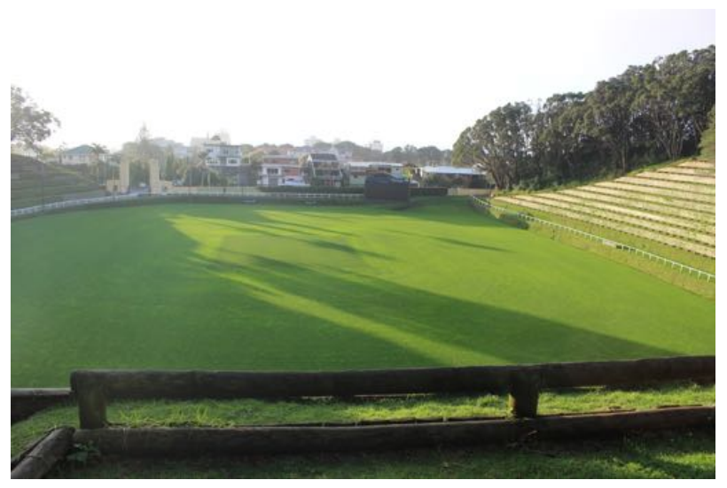
Figure 2: Pukekura Park

The picturesque cricket pitch in Pukekura Park, New Plymouth, was where the parade ground scenes were filmed. Figure 2 is taken from almost exactly the same spot as a scene in the film. The characteristic bleachers on each side of the ground are visible in the film, although the townscape in the background was digitally converted into nineteenth century Japan. This site is within a public park and has no commercial potential.