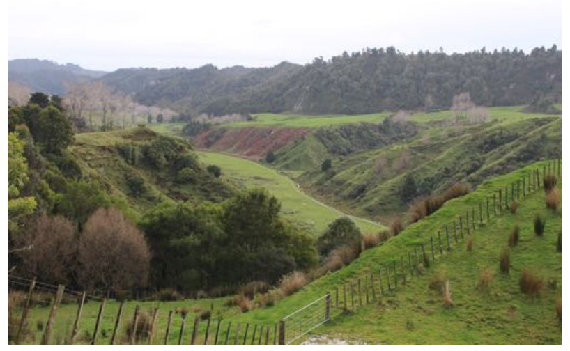
Figure 6: Samurai village approach road

After filming, the sets were dismantled. The Radcliffe family, who own the farm, built a replica of one of the buildings and ran tours to the village site. These tours had the interest not only of a tractor ride into picturesque scenery, but also afforded insights into the film production process. Historical dramas require sites that not only have no visible signs of modernity (access roads, electricity cables, and so on), but are also close enough to the cast and staff's accommodation and a large space for actors' trailers, equipment and catering trucks. The farm fitted these conditions perfectly. There was an approach road and space for trucks in the valley floor, but it was invisible from the top of the hill where the village set stood (Figures 6 and 7).<sup>2</sup> As tourists were conveyed up this road by tractor, they heard narrations about the filmmaking process. Once at the filming locations, there was a replica hut familiar to those who had seen the film.