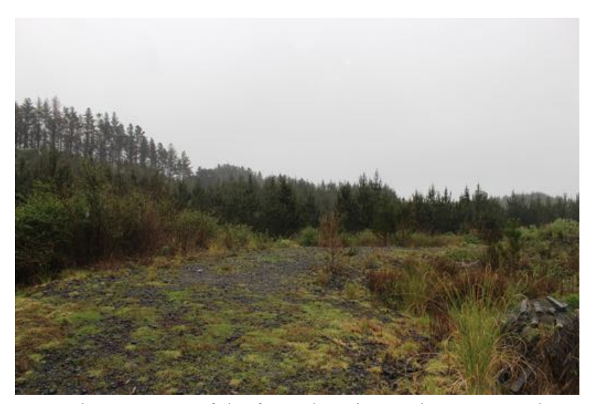
Figure 8: The remnants of the forest location, Lake Mangamahoe park.

The scene where Algren is captured by Katsumoto's warriors was filmed in woodland by Lake Mangamahoe. This site was touted as having tourism potential in 2003. The Daily News reported that 'The highlight of the Mountain Like Fuji tour will be a realistic battle scene re-enacted in a forest at Lake Mangamahoe' with riders in samurai armour ambushing tourists' (Taranaki Daily News 2003e). But, while the access road created for filming was still there, the trees on the spot where filming took place had been cut down. It was merely a graveled road with saplings growing in preparation for future felling. The atmosphere of the forest as seen in the film was evident in other parts of the forest, but the place where Algren's capture was filmed was unrecognizable.