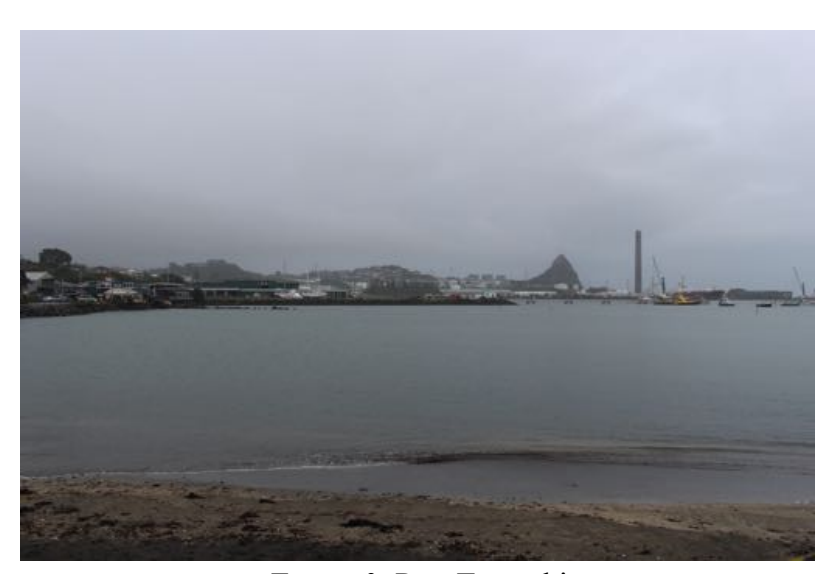
Figure 3: Port Taranaki

At the waterfront, a large set was built where the scenes set in Yokohama were shot. There are no remnants of the set today and the land is used by local businesses. Again, there is no commercial potential.