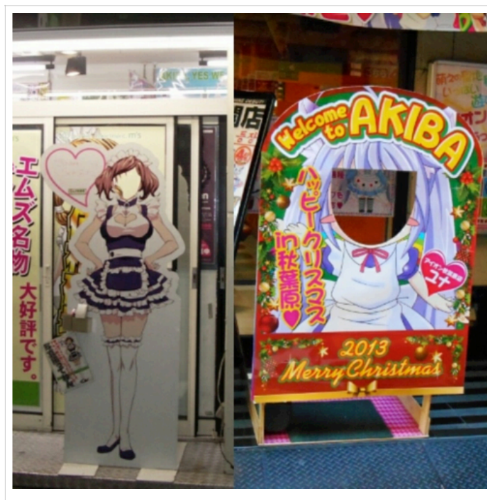
Figure 4: Tourists photo spots in Akihabara