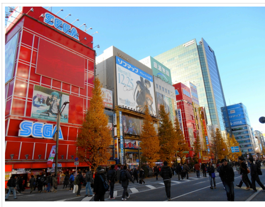
Figure 1: Chūō dōri, the main street in Akihabara

This research began when I joined a French manga-themed package tour in July 2007 organised by the travel agency Autrement le Japon and the French manga publishing house Pika. We went to Comiket (Comic Market, the biggest manga convention in Japan, which is held twice a year in Tokyo), on walks in Akihabara, on a visit of the Ghibli Museum and, as an ‘exclusive experience’, on a guided visit into the building of the Kodansha publishing house, which publishes some of the leading manga magazines such as Shūkan Shōnen Magajin . Later, I joined other groups of tourists and also had the experience of being the guide, leading tours to Akihabara for French tourists and creating the programme of package tours dedicated to manga.