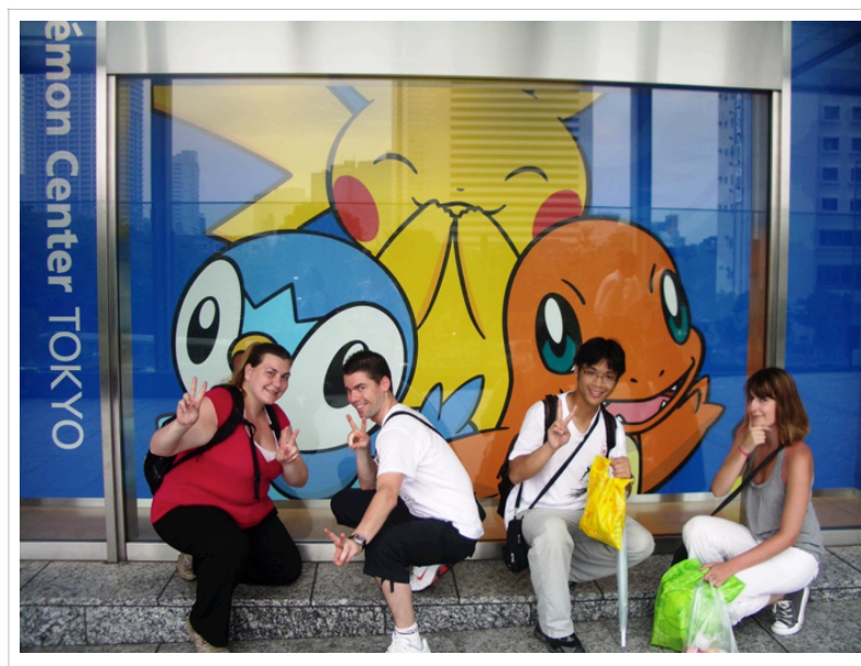
Figure 3: French tourists posing in front of the Pokémon Center, Tokyo