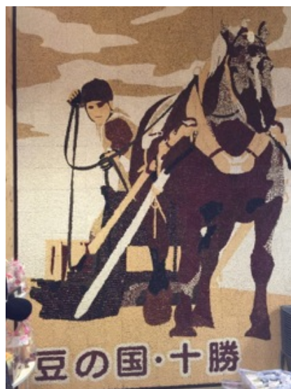
Figure 3: Portrait of a banba made of locally grown beans. August 2015.