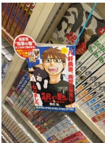
Figure 1: Bookstore display of Silver Spoon manga. August 2015.