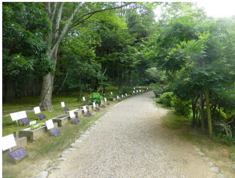
Figure 3: Kasuga taisha shin'en man'yō shokubutsuen

Other gardens, however, take an entirely different approach, and utilise minimal landscaping. This approach is particularly common among those facilities which are located in larger ‘parks’ whose function is to allow visitors to enjoy the natural environment by driving or hiking through it. For example, a visitor seeking Futagami yama kōen man'yō shokubutsuen (Toyama) needs to drive some kilometres up the mountain in order to locate the entrance to the botanical garden, while the garden itself consists of a trail through a section of the mountain with the paths simply marked, and the Man'yō plants fully integrated into the other foliage, with only the plaques identifying them to pick them out from their surroundings (Figure 4).