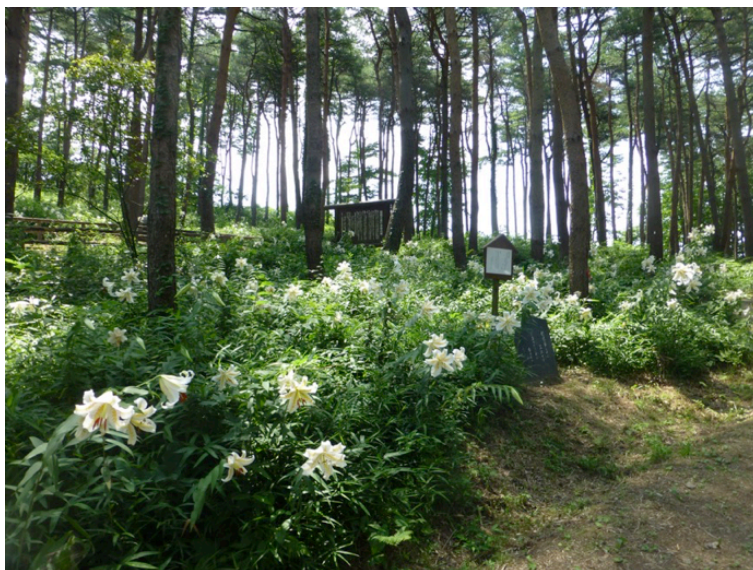
Figure 5: Shōwa man'yō no mori

A similar approach to this can be seen at Asuka rekishi kōen man'yō shokubutsuenro, although the path is somewhat more clearly defined at the latter, and also at the stand-alone Shōwa man'yō no mori, where the landscape is somewhat less steep.