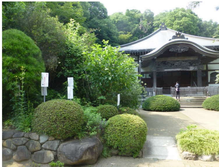
Figure 1: Kokubunji man'yō shokubutsuen