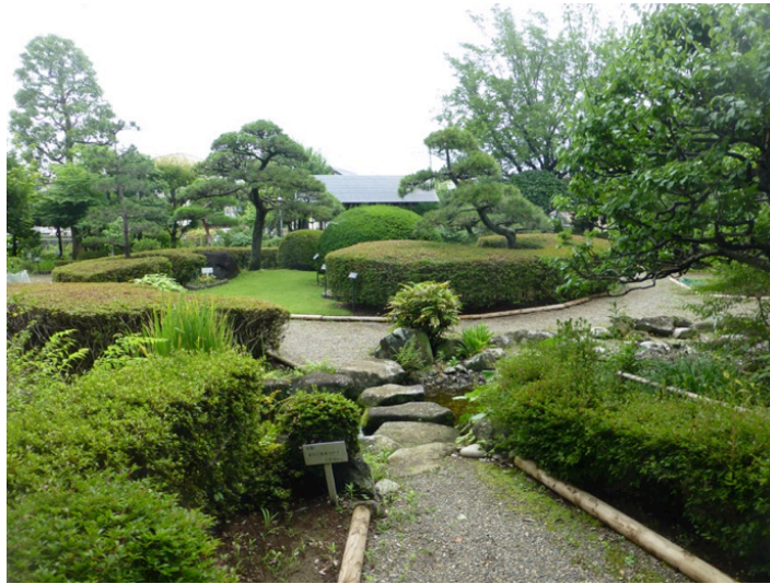
Figure 2: Ichikawa-shi man'yō shokubutsuen