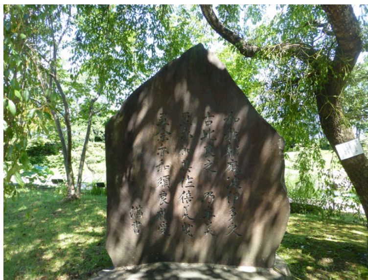
Figure 8: Man'yō no mori kōen Man'yōgana monument

For example, at Man'yō no mori kōen (Shizuoka) there is a large stone slab (Figure 8) and a smaller stone plaque.