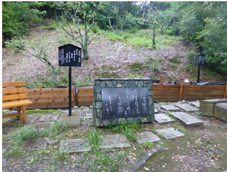
Figure 7: Kii fūdoki no oka man'yō shokubutsuen stone and explanatory plaques

aesthetic, rather than textual, object to understand the poem's contents as well as information about the plant to which it refers.