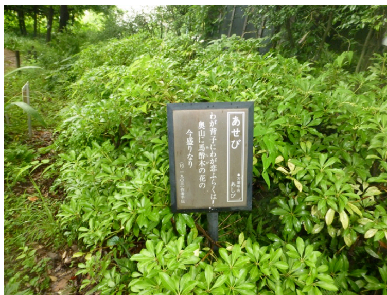
Figure 6: Akatsuka shokubutsuen man'yō-yakuyōen

For example, Akatsuka shokubutsuen man'yō-yakuyōen presents the poems in the format indicated in Figure 6.