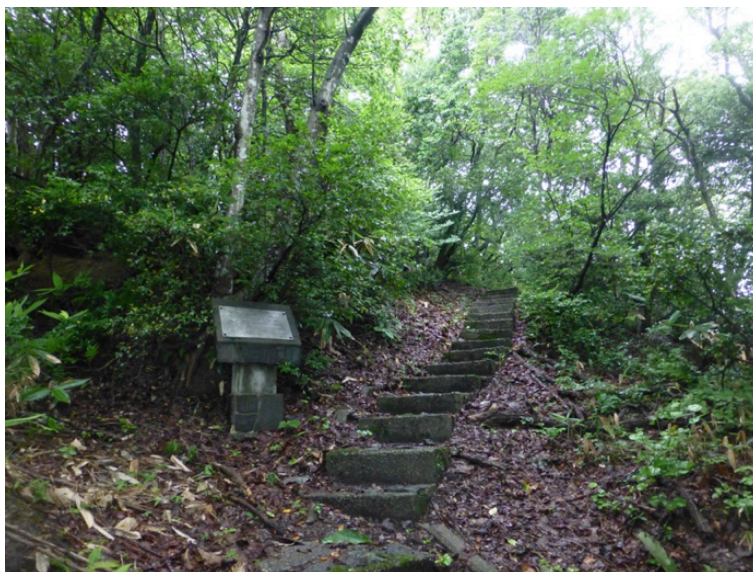
Figure 4: Futagami yama kōen man'yō shokubutsuen

A similar approach to this can be seen at Asuka rekishi kōen man'yō shokubutsuenro, although the path is somewhat more clearly defined at the latter, and also at the stand-alone Shōwa man'yō no mori, where the landscape is somewhat less steep.